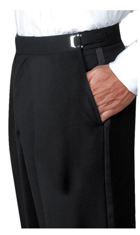
Standard adjustable formal trousers – Poly $24.00 – pleated or flat front