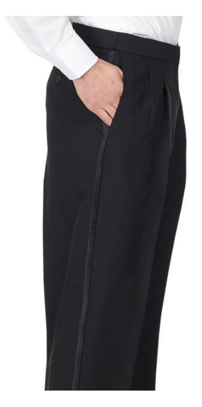
Com-fit stretch adjustable formal trousers $21.00 – pleated or flat front