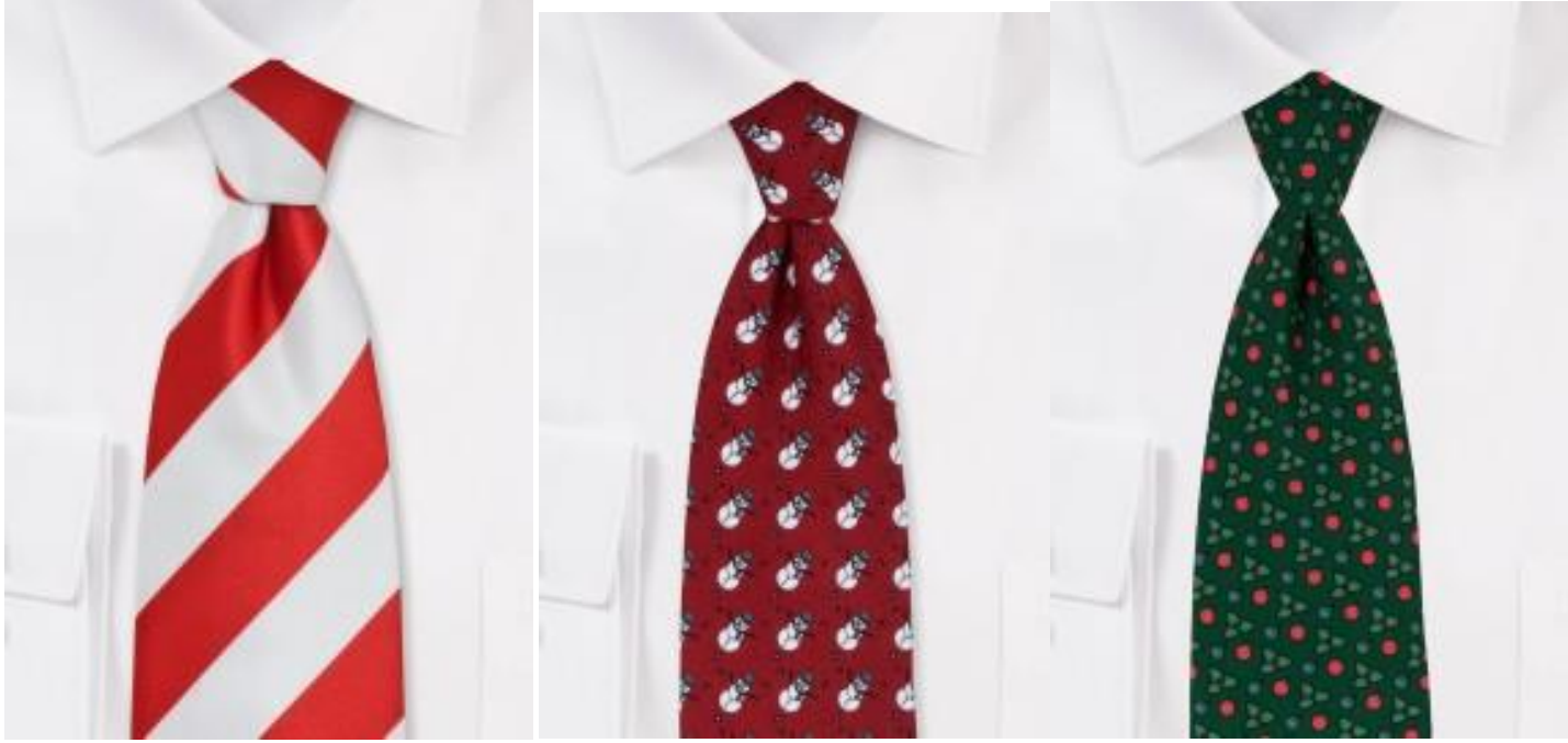
$10.00 – 65 in stock